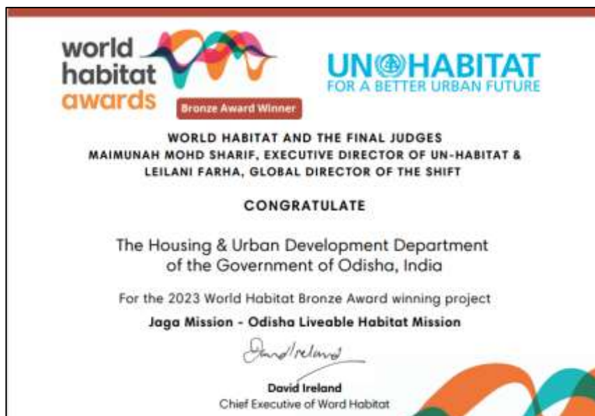
Figure 3: World Habitat Bronze Award 2023