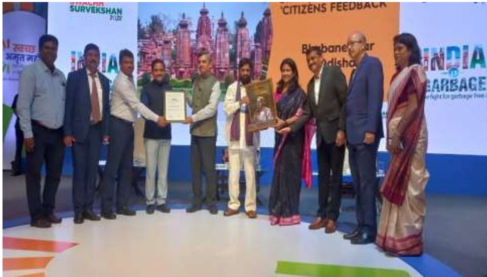
Figure 1: Swachh Suvakshan Award 2022