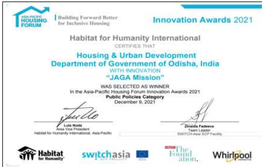
Figure 4: Asia Pacific Award 2021