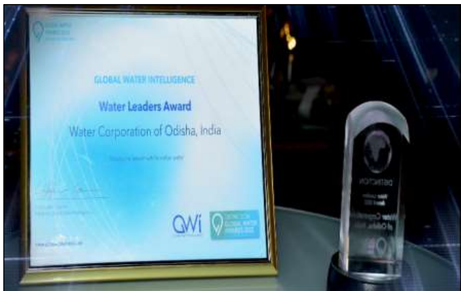
Figure 5: Waters Leaders Award 2022