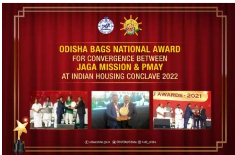
Figure 6: PMAY Awards 2021