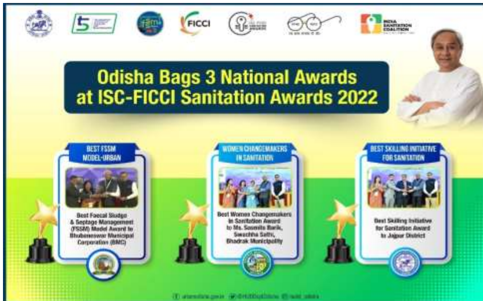
Figure 2: ISC-FICCI Sanitation Awards 2022