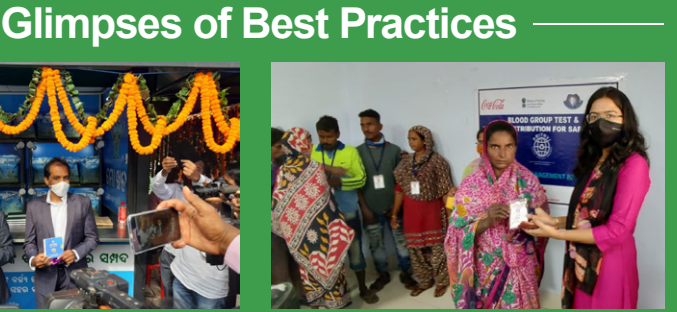
ID cards being given to rag pickers at Cuttack Municipal Corporation by Commissioner