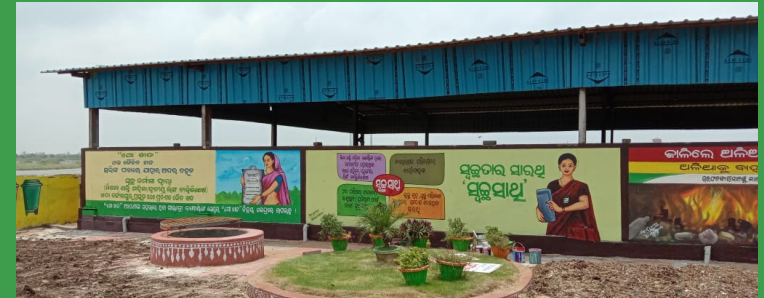
Wealth Centre is branded with beautiful messages at Paradeep Municipality